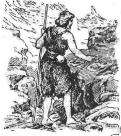
John 1 v 19 - 34